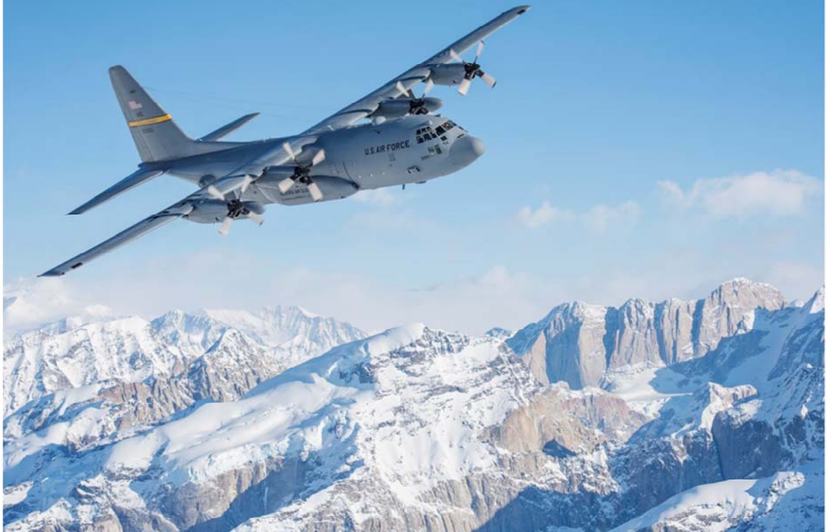
C-130 Hercules over Denali National Park and Preserve, AK